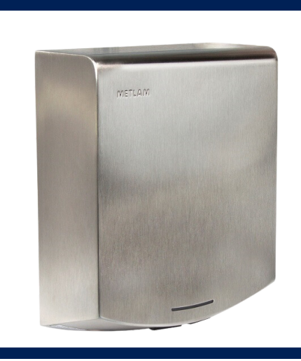
Eclipse Slimline Auto Hand Dryer Code: ML_ECLIPSE05_SS