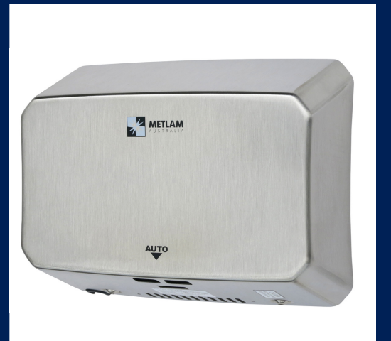
Eco Slender SS