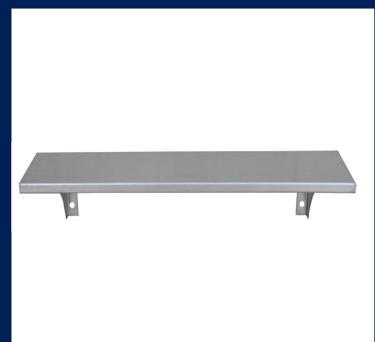
Utility Shelf 300mmW x 105mmH x 127mmD