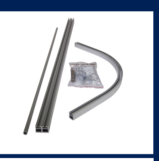
L Bend Modular Shower Curtain Track System