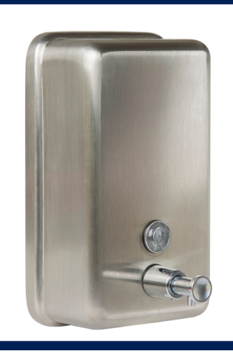
Vertical Soap Dispenser Code: ML605AS_N