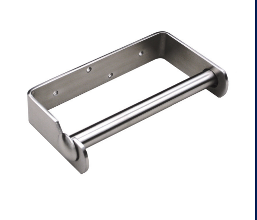
Single Toilet Roll Holder Code: 113_TRH_SS