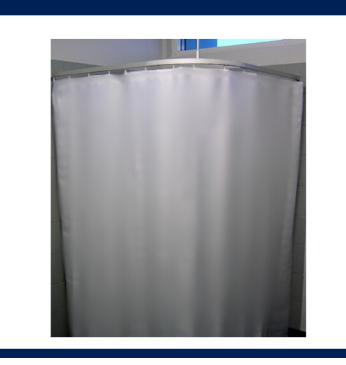
Polyester Taffeta Shower Curtain 3000mm x 1800mm (Rod and track are not included) Code: SC_WNT3018