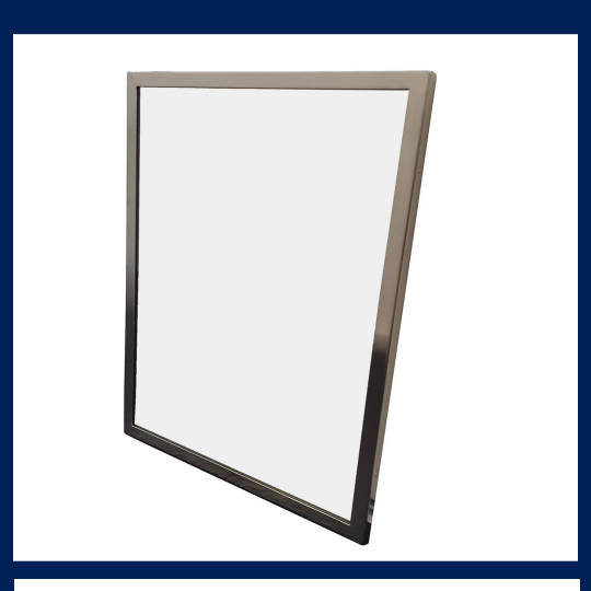
Framed Mirror Stainless Steel -450mmW x 1000mmH