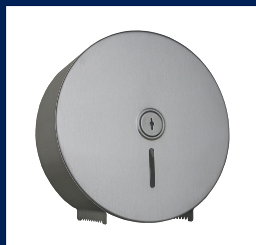
Jumbo Toilet Roll Dispenser Code: ML841