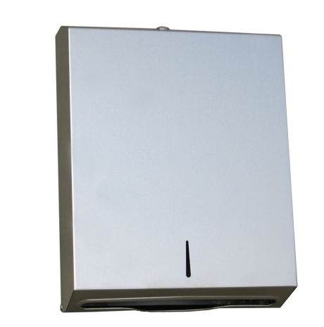
Paper Towel Dispenser -Stainless Steel