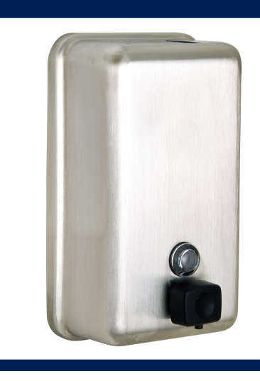
Vertical Soap Dispenser -Button Pump Valve Code: ML605BS_N