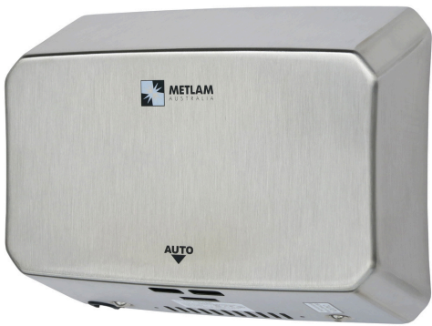
Eco Slender SS Code: ML_ECOSLENDER05_SS